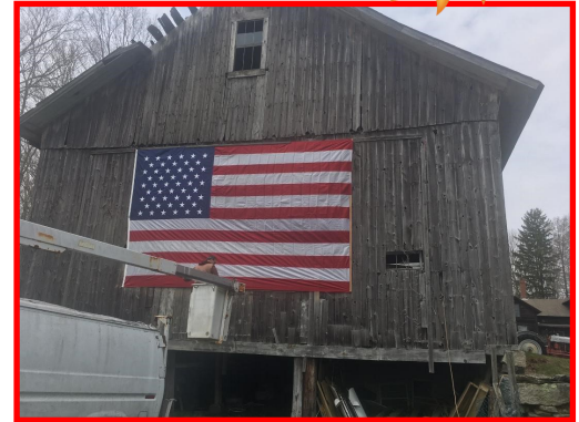
The new flag is up!!!!

Fishing is ON!!! Six feet apart unless you are family!