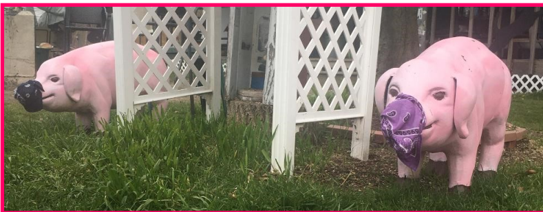
Kenny's pigs are properly masked & complying with social distancing.