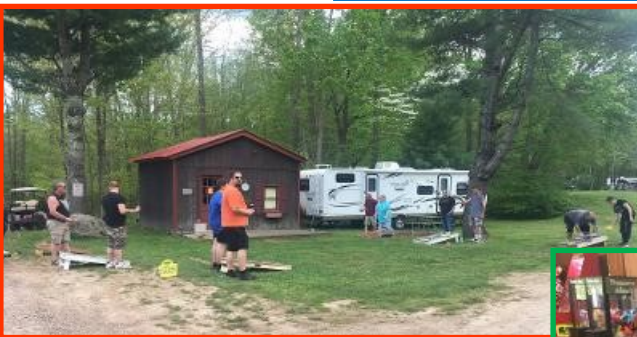
Corn Hole is baaacckkk!