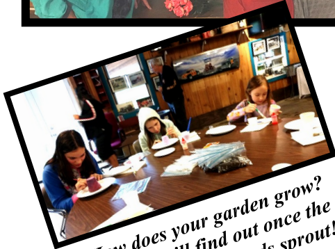
How does your garden grow? We will find out once the Marigold seeds sprout!