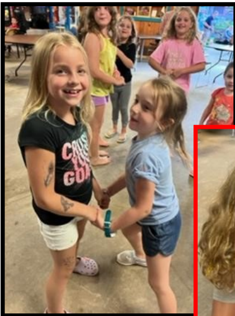
My Kids are adorable... and Talented!